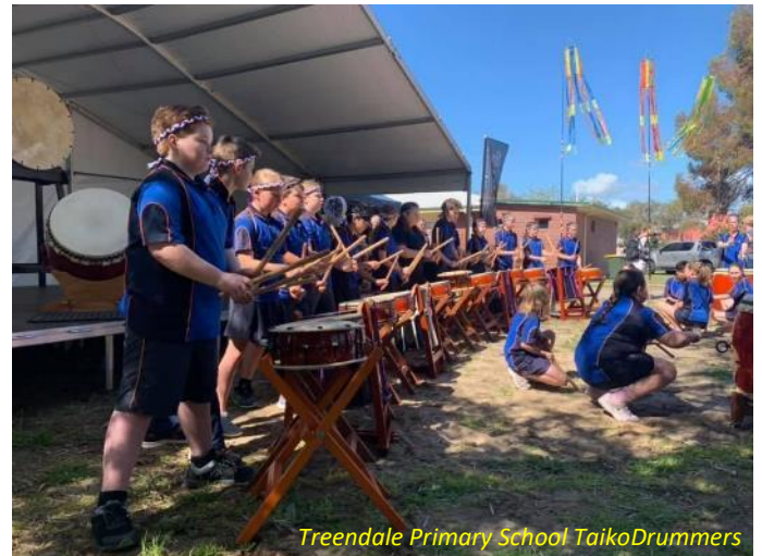
Treendale Primary School Taiko Drummers