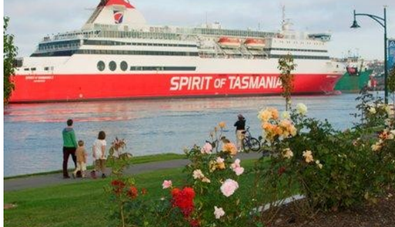
The Spirit of Tasmania, arriving in Devonport

The Youth Leadership Conference will be a must attend for aspiring leaders from across Australia where there will be an exchange of ideas.