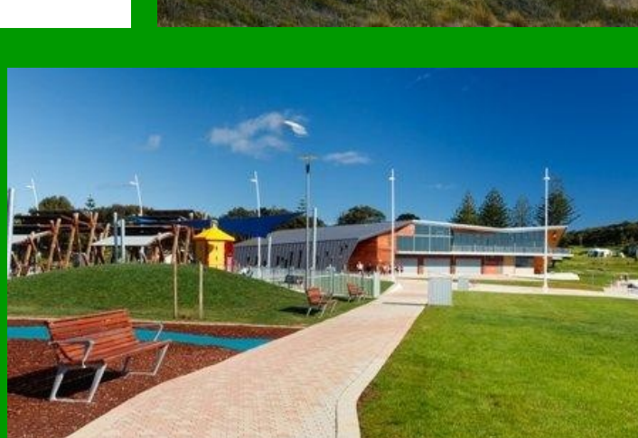
Devonport Surf Club