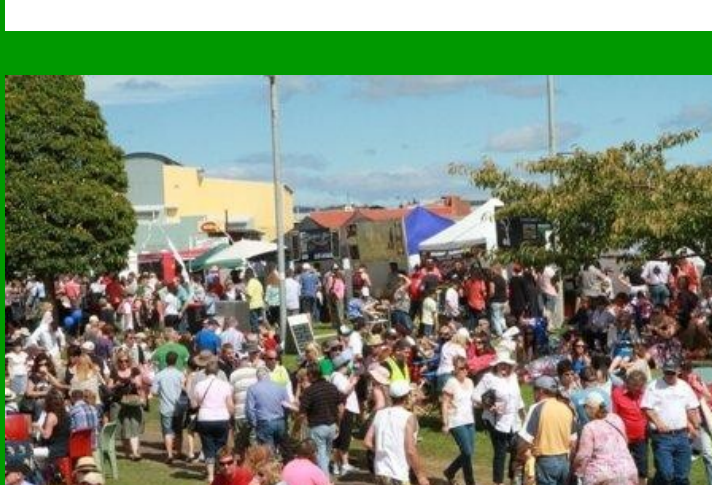
Taste the Harvest Festival, Devonport