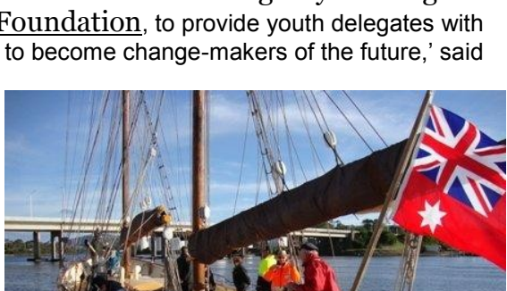
The Julie Burges sets sail

'Along with expanding our understanding of social justice issues across the globe, Oaktree will work with us on how to take action on the important local issues.'