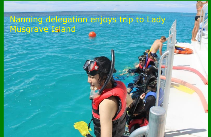
Nanning delegation enjoys trip to Lady Musgrave Island

included snorkelling on Lady Musgrave, touring the Bundaberg Rum facility and sampling local produce.