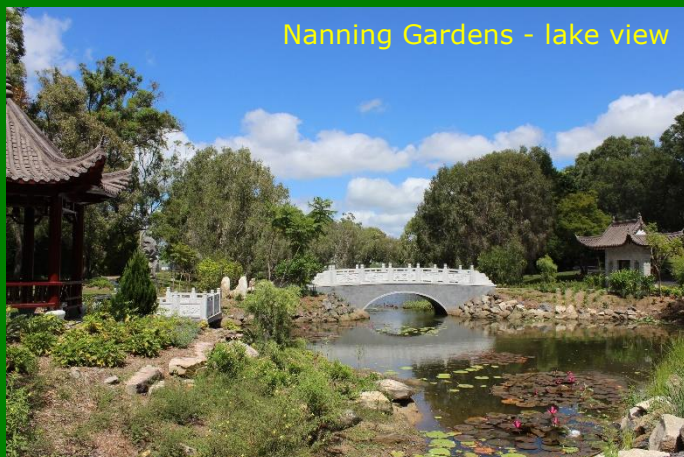
Nanning Gardens - lake view

In 2018 Bundaberg Regional Council will celebrate the 20 year anniversary of its Sister City relationship with Nanning, China.